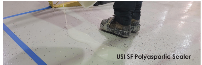
USI SF Polyaspartic Sealer

https://www.usigroups.com/product/usf-lvp-high-build-quick-set-epoxy-1-5-gallon/