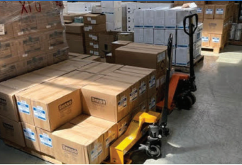
WIXOM, MI WAREHOUSE