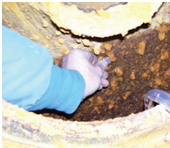
Close up: cavitation, erosion/corrosion