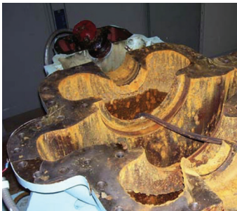
Before: cavitation, erosion/corrosion