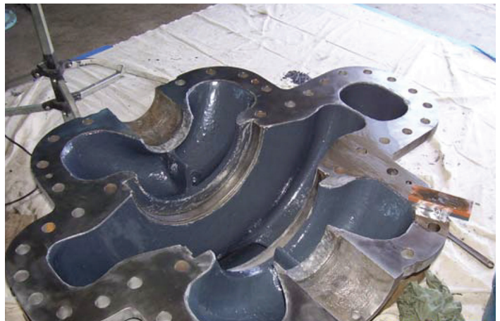
After: blasting, metal filler, 2 top coats