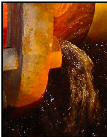
TREATED WATER PIPE LEAK REPAIR

FOLLOW THE LINKS BELOW TO READ THE FULL SUCCESS STORIES OF USI'S INNOVATIVE SOLUTIONS ON LEAKING PIPES AND GROUND WATER INTRUSION