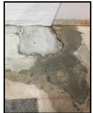
AUTOMOTIVE TUNNEL WATER LEAK CONCRETE REPAIR

https://www.usigroups.com/success-stories/auto-plant-striping-pit-repair/