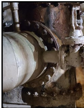
PAPER MILL PIPE REPAIR

https://www.usigroups.com/success-stories/treated-water-pipe-leak-repair/