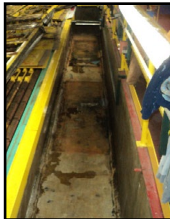
AUTO PLANT STRIPING PIT REPAIR

https://www.usigroups.com/success-stories/paper-mill-pipe-repair/