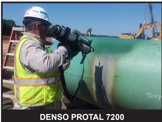
DENSO PROTAL 7200

HOT SHOT Same Day Local Deliveries for Emergencies and Next Day Deliveries for orders placed by 2:00PM