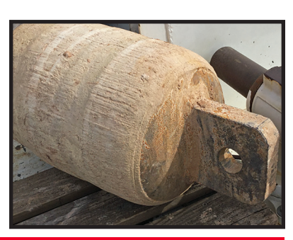
PHOTO: Bore-head with Stop It® Boreshield™ Minimal Damage after 4 sequential pulls of ~1000 FT, preserving the integrity of the weld.