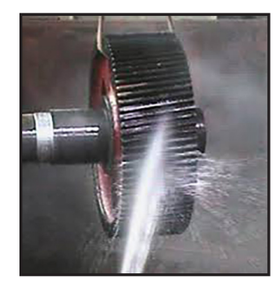
EASY TO REMOVE